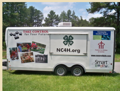
The Mobile Messenger (M2)

The M2 is a mobile information hub for Moore County families. It is equipped with computers, Internet, and printers so you can create a Community C.A.R.E. Profile and Success Plan wherever you are!